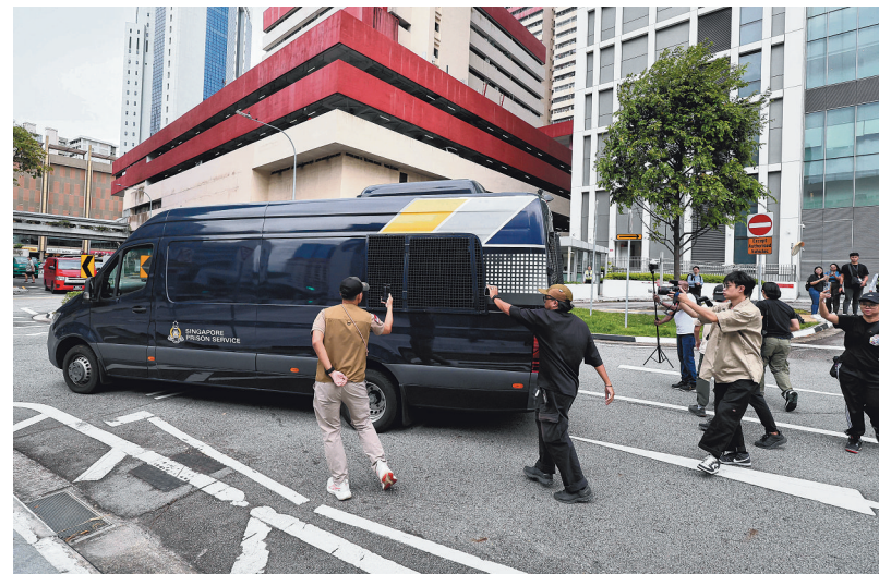
Former transport minister S. Iswaran (right) leaving the State Courts in a prison van on Oct 7, heading for Changi Prison.

"I am grateful to my lawyers and also to the many who have ex-